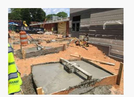
Canopy Footings at Bus Loop