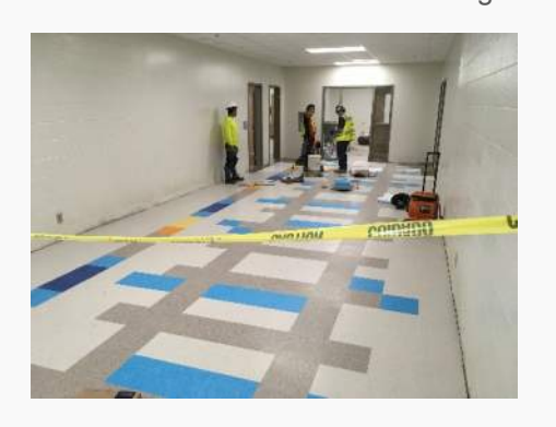
VCT Flooring at Reno Building