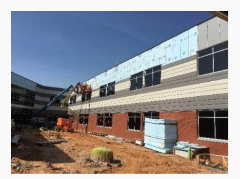
Windows & Metal Panels at Courtyard