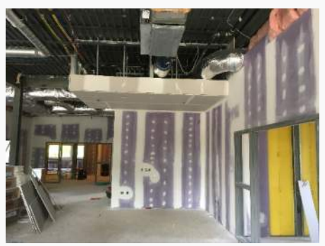
Gyp. Bd. Tape & Finish at Media Center