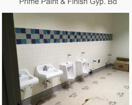
Plumbing Fixture & Wall Tile Reno