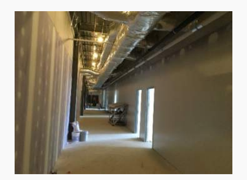
Prime Paint & Finish Gyp. Bd