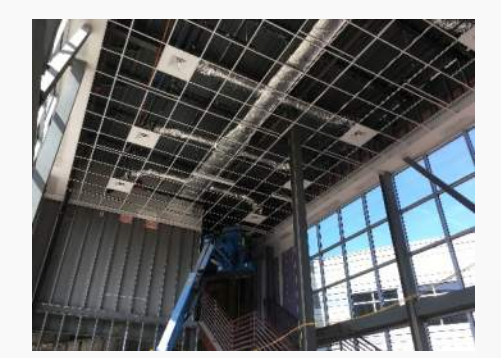
Lobby Window Wall, Duct, Ceiling Grid, & Gyp. Bd.