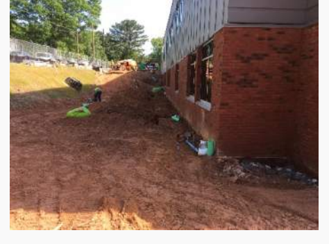
Installing Downspout Drains