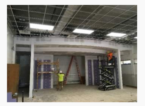
Stage Gyp. Bd Finish at Auditorium