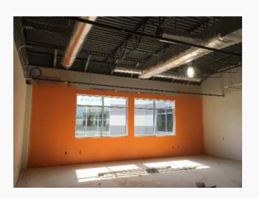
Paint at Classrooms New Building