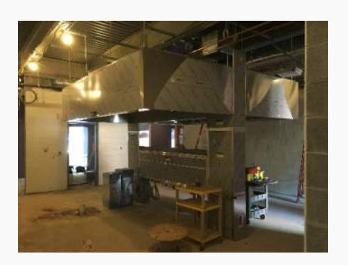
Kit. Hood & UDS